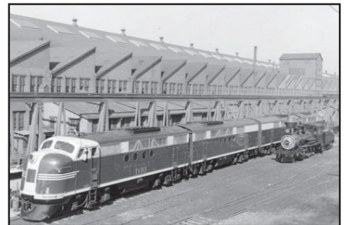
Above Cyrus K. Holliday steam engine, 1941