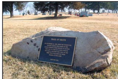
Left: Trail marker, Warren Co., IN